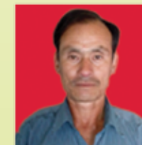
Kg. Meijinlung Peon Mannipur Zoological Garden, Itanagar