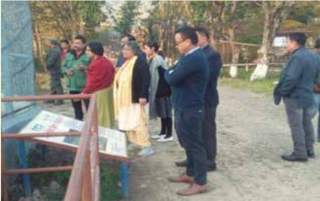
Member of Administrative Tribunal from Karnataka