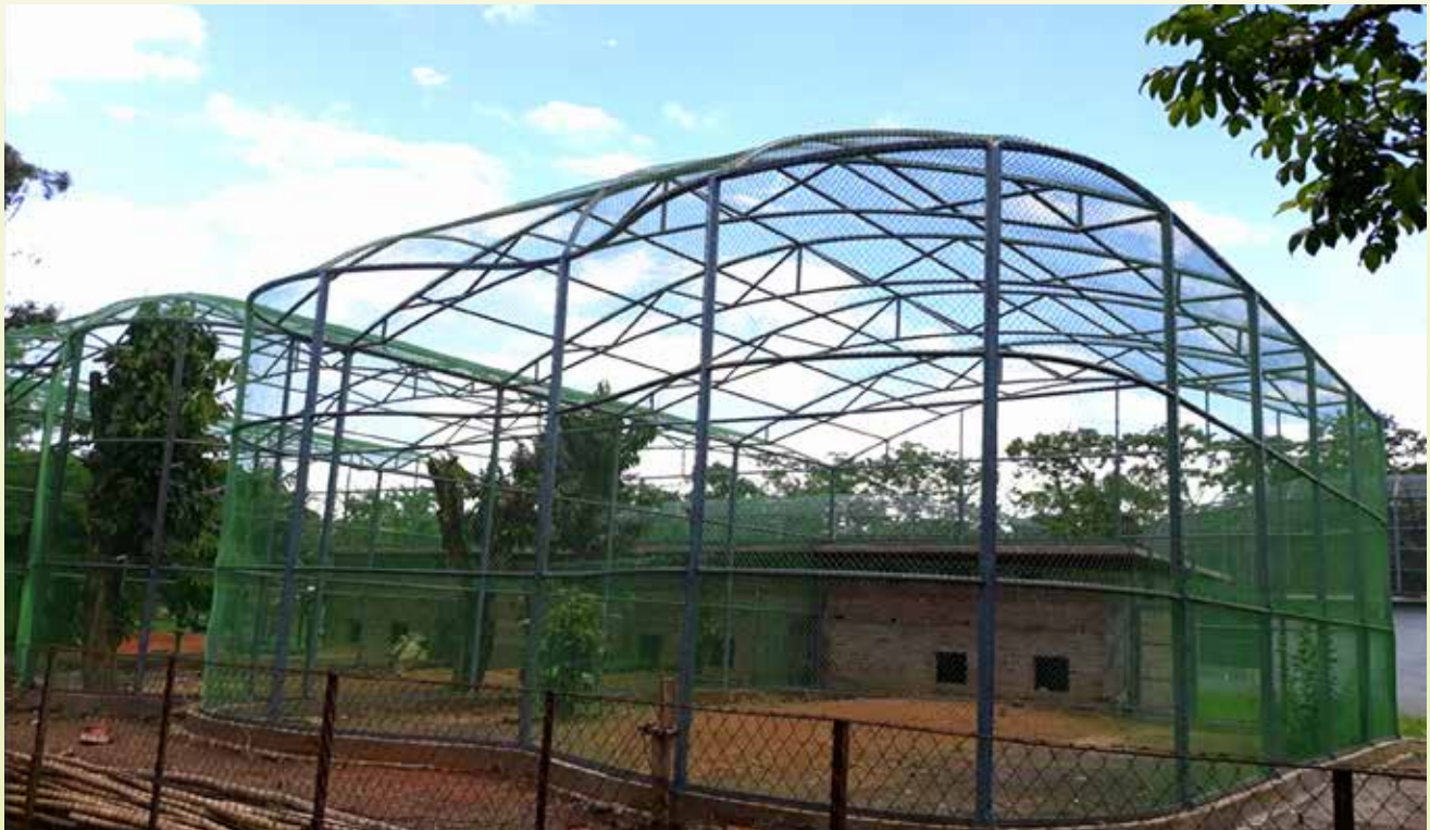
Photograph showing Keeper's gallery/ Kraal/Night Shelter (back portion) of Slow Loris Enclosure