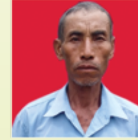
L. Nilchandra A/Feed Mannipur Zoological Garden, Itanagar