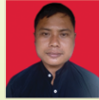
L. Bhagawan A/Feed Mannipur Zoological Garden, Itanagar