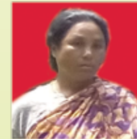
Premabati Barkeeper Mannipur Zoological Garden, Itanagar