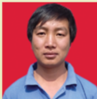
S. Ninghor A/Feed Mannipur Zoological Garden, Itanagar